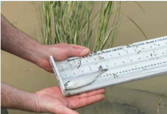
Figure 4. Coho captured at site 20 in March 2017

Seining and minnow trapping at the 11 fisheries monitoring sites, over the five month sampling period, identified the presence of 15 known species (20 species were sampled in 2016).