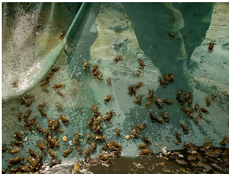
Figure 5. Unidentified shore crab (Yellow or Lined) in June 2016 at site #8

Significant numbers (212) of staghorn sculpins ( Leptocottus armatus ) were captured in 2017. This is the second year of increased staghorn sculpin numbers in the project area. Three-Spined Stickleback continue to be captured in the thousands of individuals. The number of Sacramento Pike Minnow has increased alarmingly in 2017 as compared to previous years. This may be due to the higher precipitation through the winter and spring providing suitable low salinity habitat throughout a majority of project area, whereas previous years the region was in a drought and the marine environment stayed highly saline throughout the winter and spring. In June of 2016, a highly abundant species of shore crab (yellow or lined) was first seen in the estuary since restoration was completed in 2013 (Fig 5). For this sampling season, the crabs have reduced from numbers in the thousands in 2016 to just a few individuals in 2017.