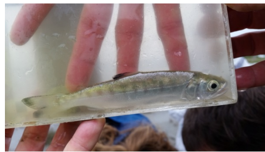
Figure 3. Coho captured at site #18 in April