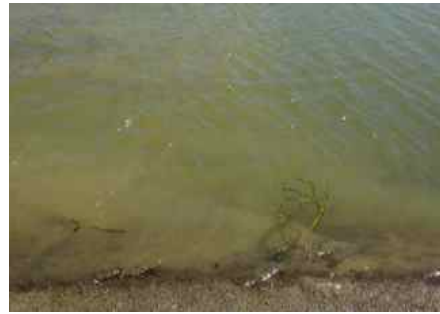
2014 SR, T14, 68°