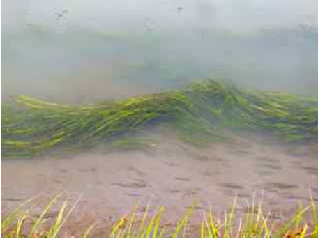
2013 SR, T14, 70°