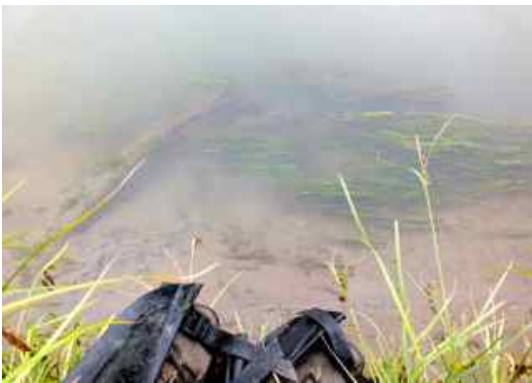
2013 SR, T17, 30°