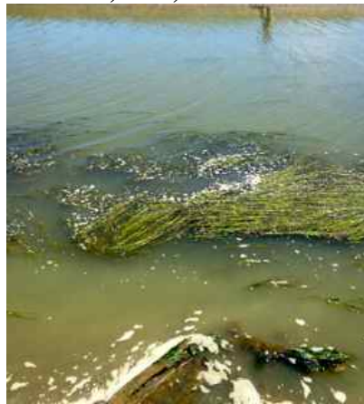
2014 SR, T17, 40°