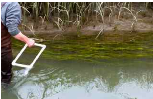
2013 SR, T18, 6°